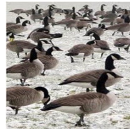
A gaggle of geese