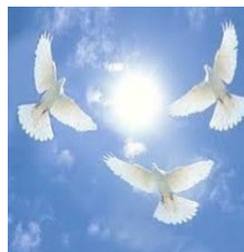
An exaltation of doves

Note: Submissions for the August Newsletter should be sent to