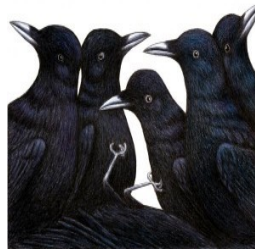
A murder of crows