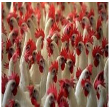
A flock of chickens