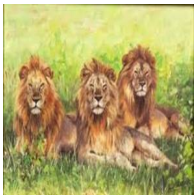
A pride of lions