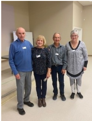
Winners of the 50/50 draw