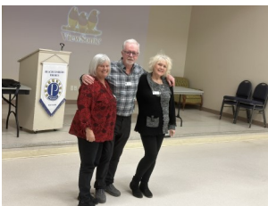
Winners of the 50/50 draw