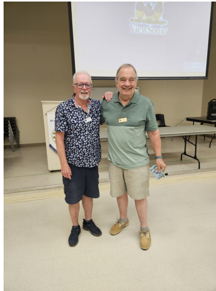
Winners of the 50/50 draw

More photos on our web site in the General Meetings tab