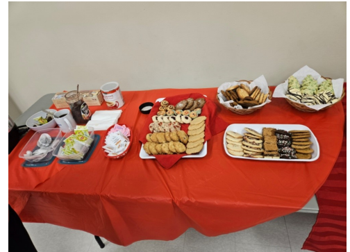
Celebrating a very festive time