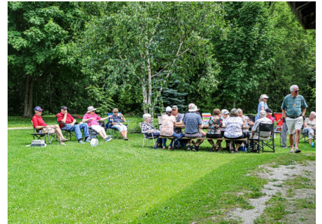
Beachcombers Probus members enjoying our annual picnic at the Heritage Park in Elmvalle with lunch served by Valley Farm